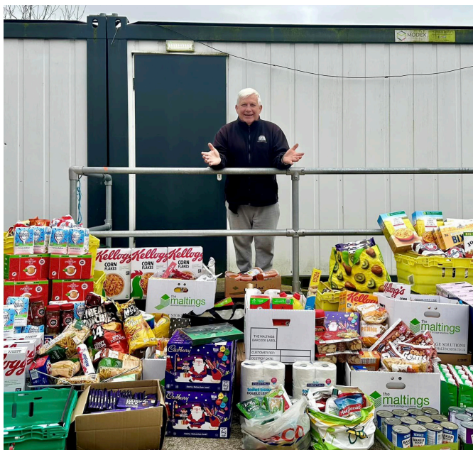
Blue self storage providing The Llanrumney Hall Pantry with a truck load of food for our Christmas Pantry Day!