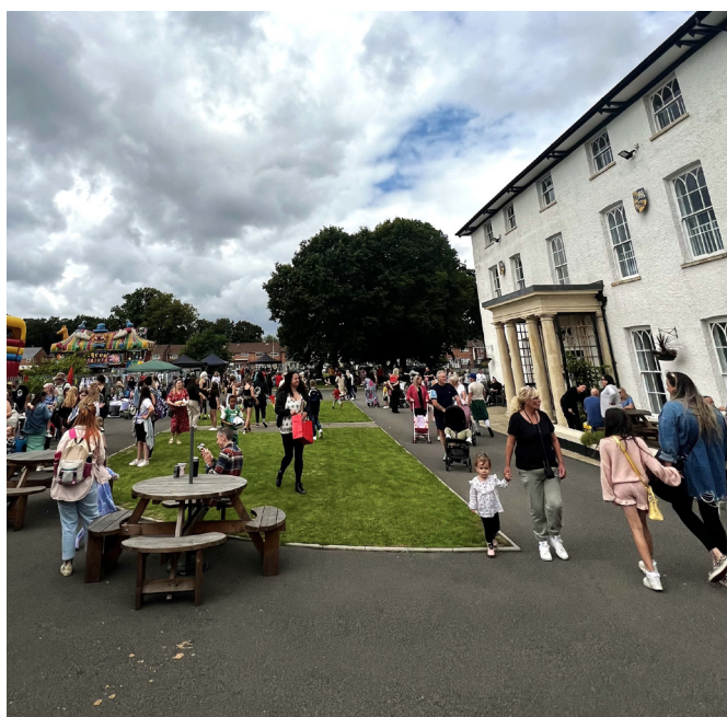
The Llanrumney Hall Community Trust grounds crowded with people for our annual Summer Fete.

couldn't do what we do without those who believe in us. We are also extremely grateful for the countless donations from local people and businesses who continue to support our charity. My company CMB Engineering remains in the background to provide additional support when required.