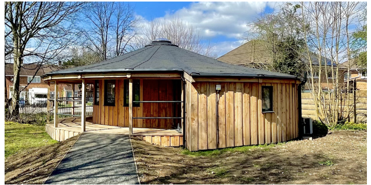
Our Welsh Government Funded Health & Wellbeing Roundhouse.