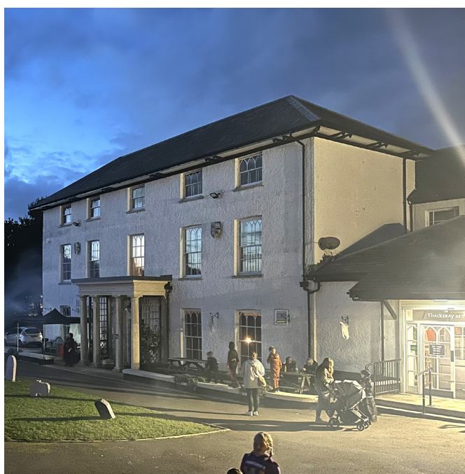
Llanrumney Hall during our 3-day Halloween Haunted House of Horrors community event.