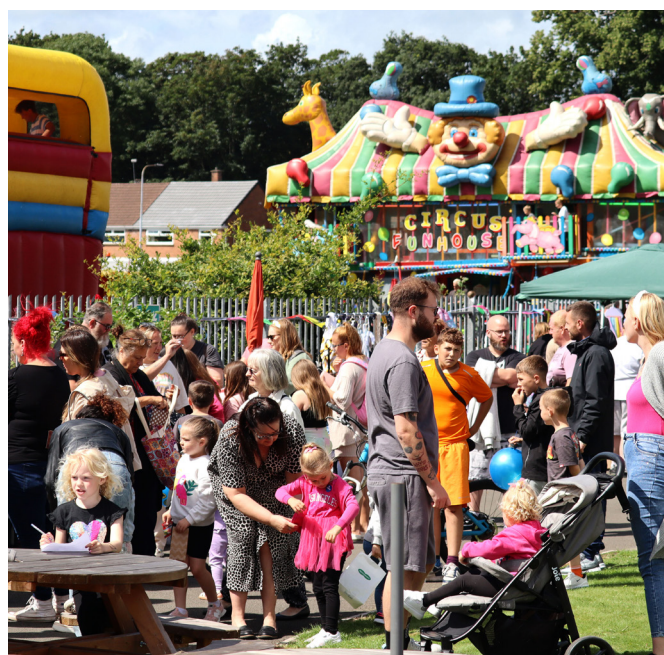
The Summer Fete included fairground rides, bouncy castles, food vendors, activities, stalls and more