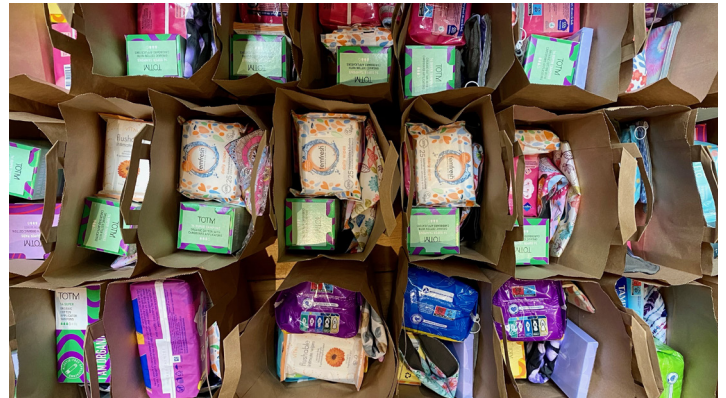
The free sanitary bags we offer all women and girls thanks to funding from Cardiff Council.