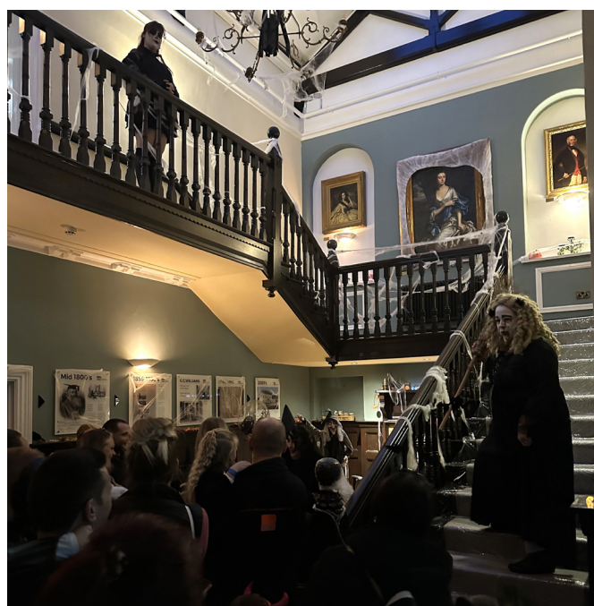
The Halloween event included a Halloween themed house tour of our historic building with live actors throughout.