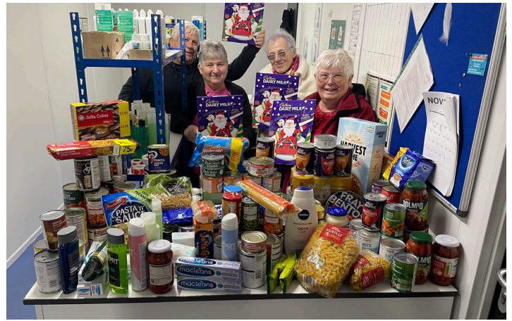
One of the countless donations of food and household essentials The Pantry received from St. Dyfrigs Church.

Our staff and volunteers have yet again played a momentous part in the running of The Hall, whether that's on a weekly basis or during our larger scale events such as Halloween and the Summer Fete.