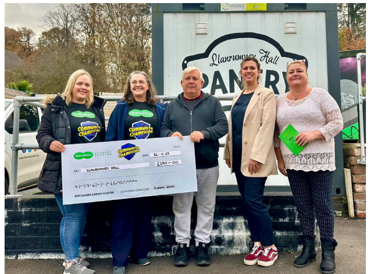
Local specsavers branch give £250 cash donation to Llanrumney Hall Community Trust.